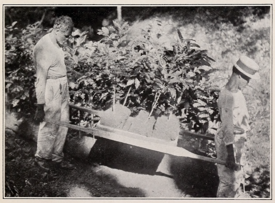
Fig. 2.—CARRYING SEEDLINGS FROM NURSERY TO FIELD.